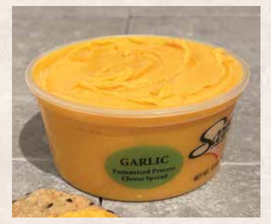
4924 • $12.00 Garlic Cheddar Cheese Spread Oueso cheddar con ajo para esparcir

Classic cheddar cheese blended with the zip of garlic to create this classic favorite. 12 oz. deli cup.