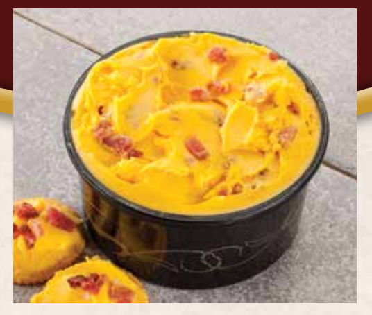
4529 • $12.00 Bacon Cheddar Cheese Spread Oueso cheddar con tocino Bits of hickory-smoked bacon blended with tangy cheddar. 12 oz. deli cup.