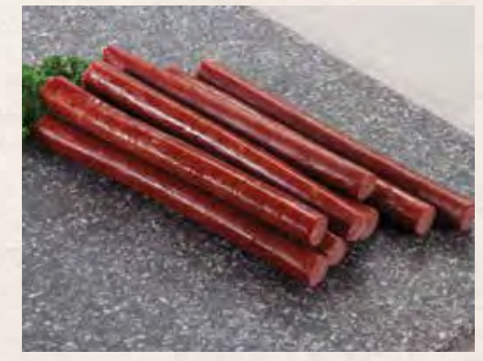
7125 • $20.00 Beef Sticks Palitos de carne These all-beef snack sticks are full flavored and conveniently sized. 8 oz.

4927 • $12.00 Garden Vegetable Spread Salsa para vegetales Vegetables are combined with a refreshing cheese spread to create this creamy delight. 12 oz. deli cup.